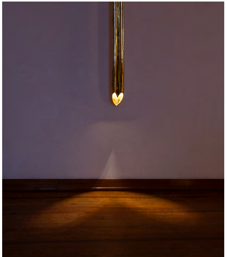
OTAGEP Earring Light Sand Casted Bronze 206 x 34 x 22 cm