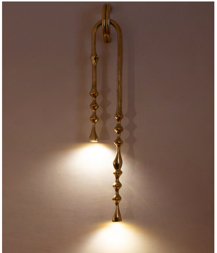
RIOLOVE Grande Pending Sand Casted Bronze 245 x 35.5 x 12.3 cm