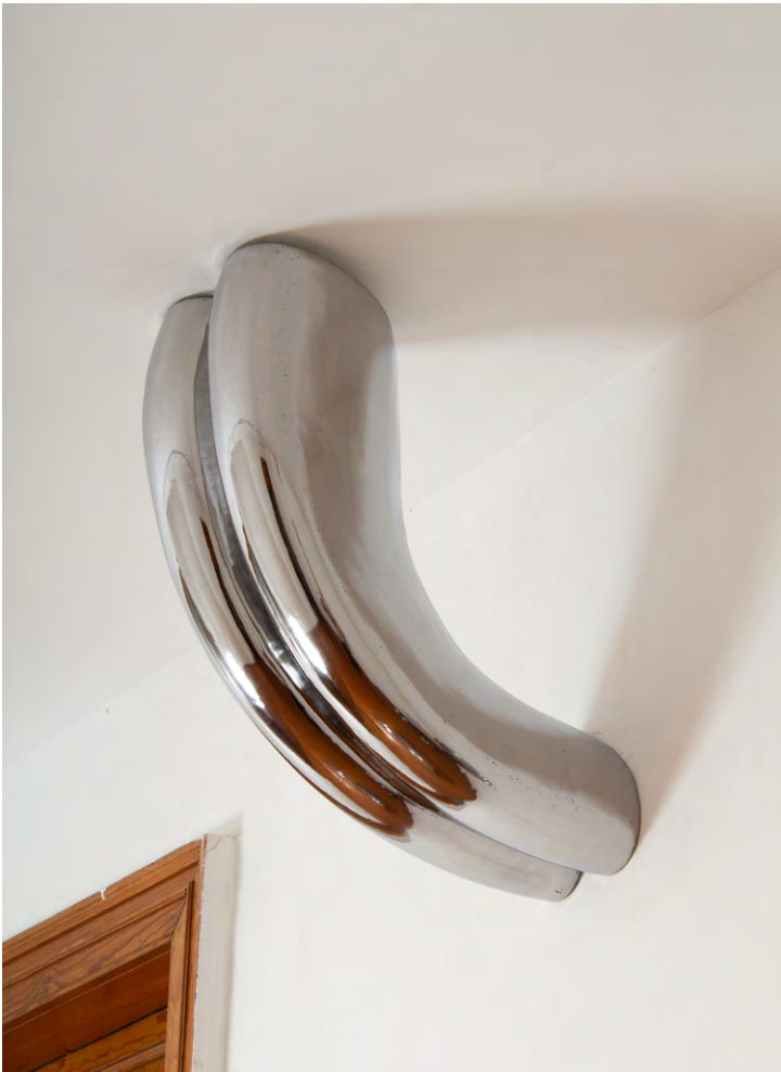
The Big Flow Ceiling to Wall Installation Handcrafted Polished Steel 64 x 61 x 44 cm