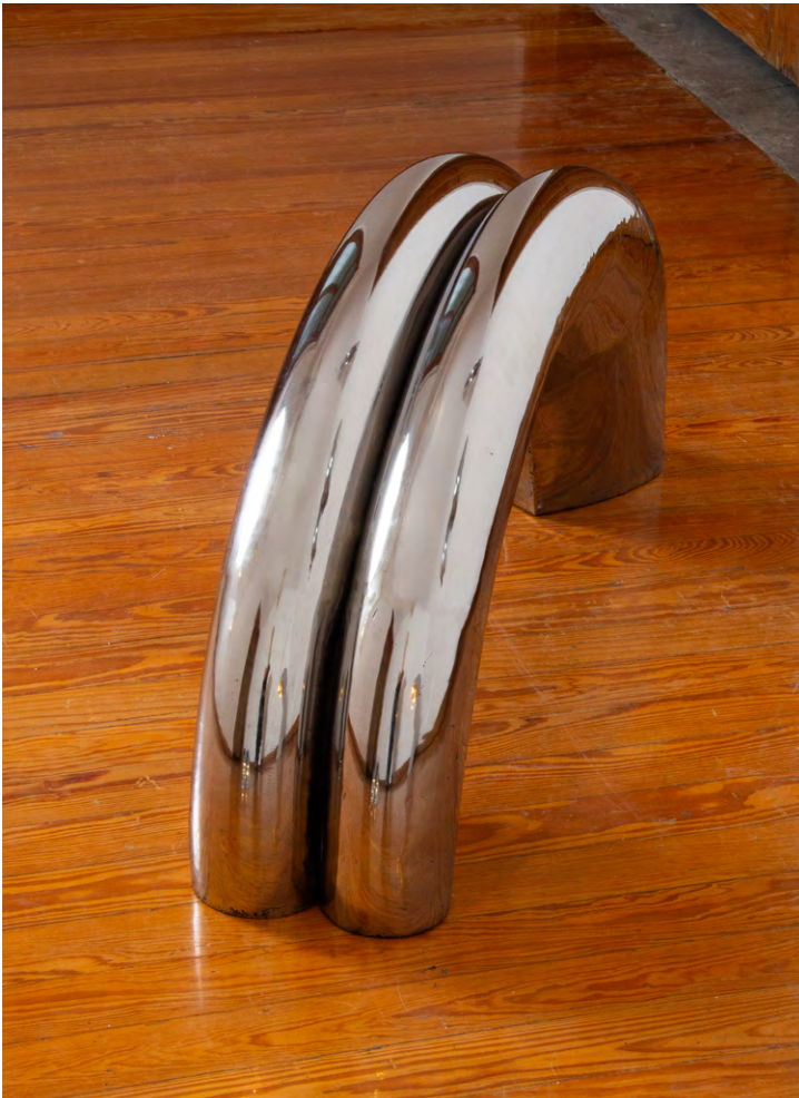
The Big Flow Seating Installation Handcrafted Polished Steel 45 x 22 x 100 cm