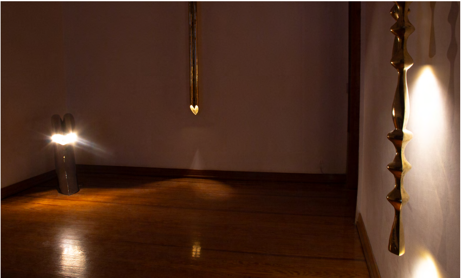
Install Views.