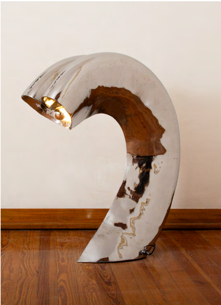
The Big Flow Floor Lamp Handcrafted Polished Steel 95 x 100 x 25 cm