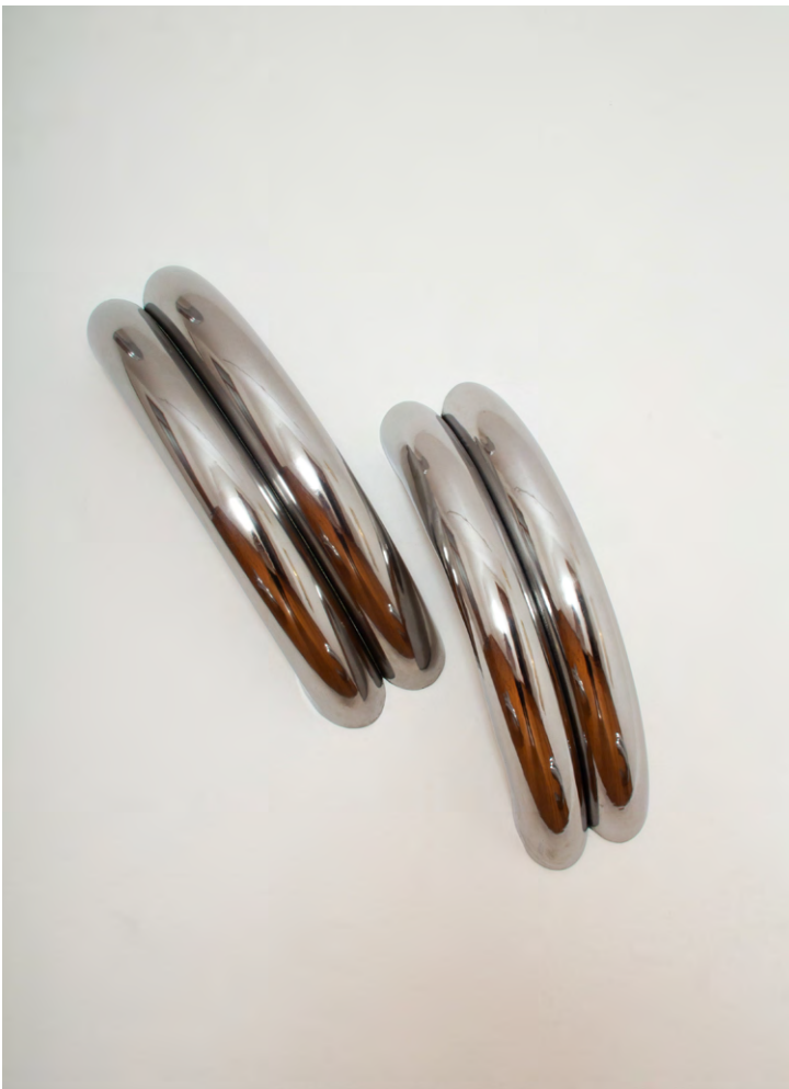
The Big Flow Two Piece Wall Installation Polished Handcrafted Steel Each: 85 x 21 x 22 cm